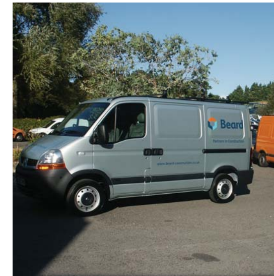
One of Beard's new silver Movono vans

Beard's 'friendly, efficient and committed' core values were identified by the survey Beard commissioned to find out how customers viewed the company. However, this same 'perception' survey, carried out by Camargue in 2002, also revealed that most customers thought Beard was smaller than it actually was. This difference between Beard's actual success and its perceived